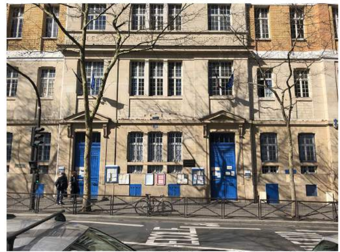
School entrance - Photo : Jean-Marie Bryant