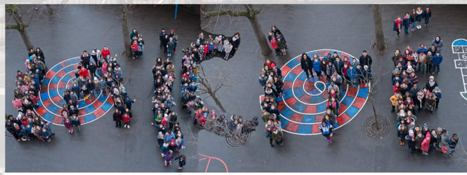
ÉCOLE ÉLÉMENTAIRE B SIMON BOLIVAR PARIS DECEMBRE 2017

Every december 9th, it's the National day of Secularism (Laïcité). This year, pupils of school B decided to compose a photography with the word Laïcité.