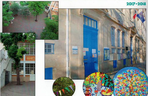
Ecole Élémentaire Simon Bolivar A 2017-2018